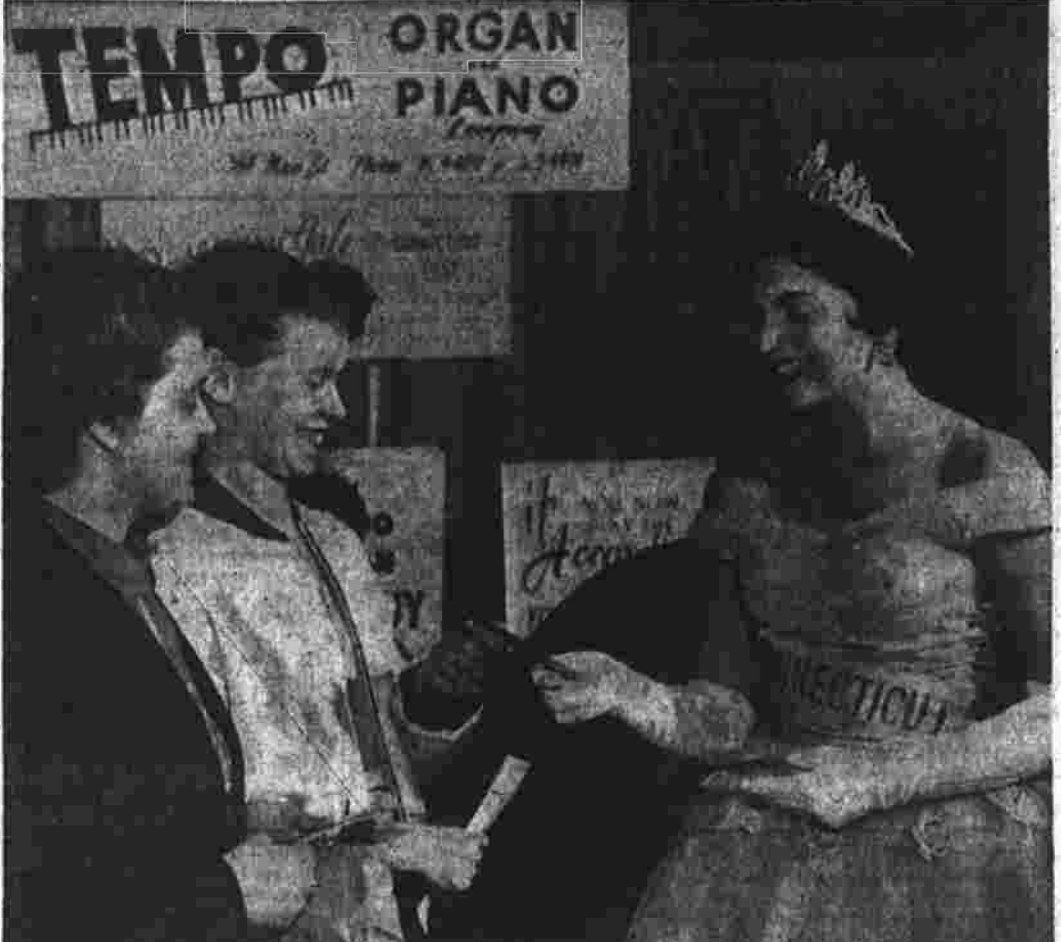
Miss Universe State Queen at Products Show